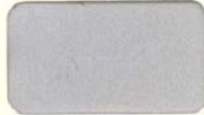
Silver Grey YLE06