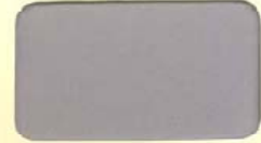
Light Grey Pearl YLE035