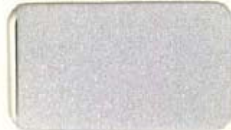
Silver Metallic YLE05