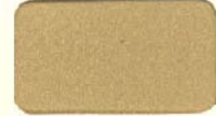
Golden Metallic YLE08