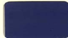
Navy Blue YLE015