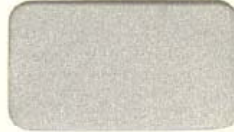
Champagne Gold Metallic YLE018